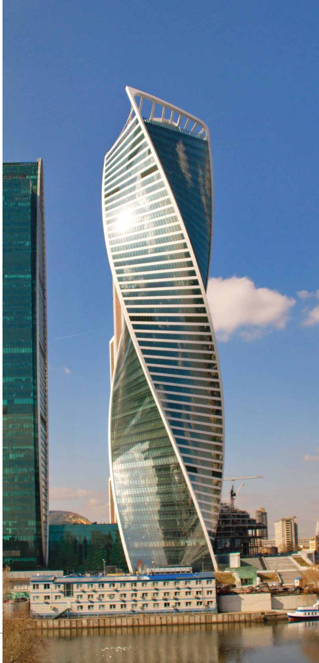
Figure 2. Evolution Tower, Moscow.

The design of the tower crown was further improved by separating two ribbons with the