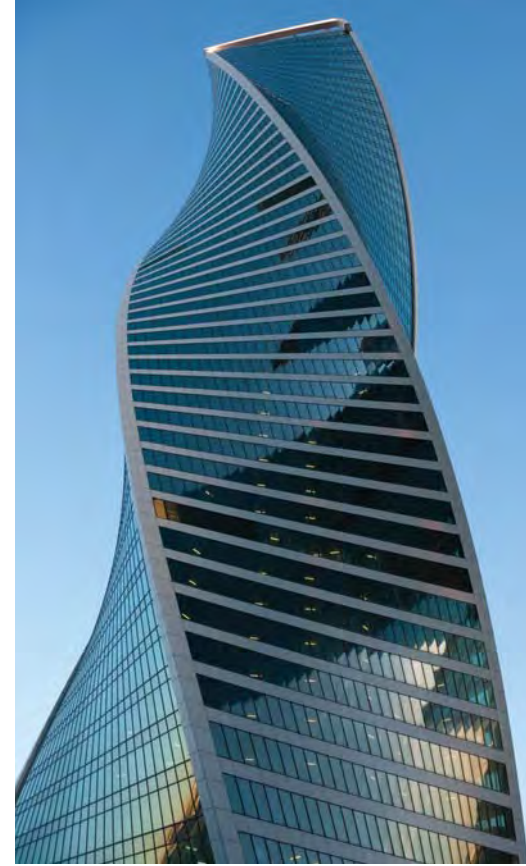
Figure 10. The tower’s twisting curtain wall creates an optical illusion.

However, the implementation of this façade structure was successful due to the selection of a skilled design-build contractor for the production of the curtain wall, atrium