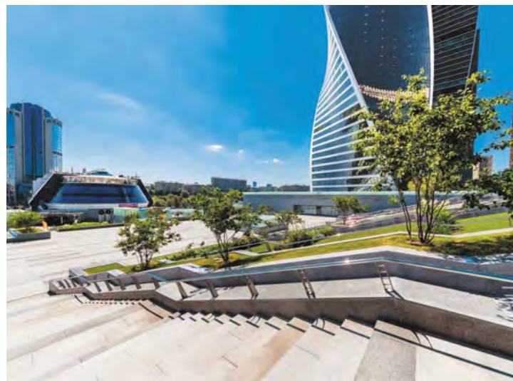
Figure 13. A terraced podium provides a transition from river level and contains a two-level mall with access to metro lines and the pedestrian bridge. © Gorproject

“standard” benchmark high-rise tower. Double-glazed units with energy-efficient multi-functional glass provide the energy efficiency and thermal insulation parameters (U-values) similar to those of standard triple-glazed units, as are normally used to withstand Moscow’s harsh winters, but with less weight than would be typical for a panoramic floor-to-ceiling application.