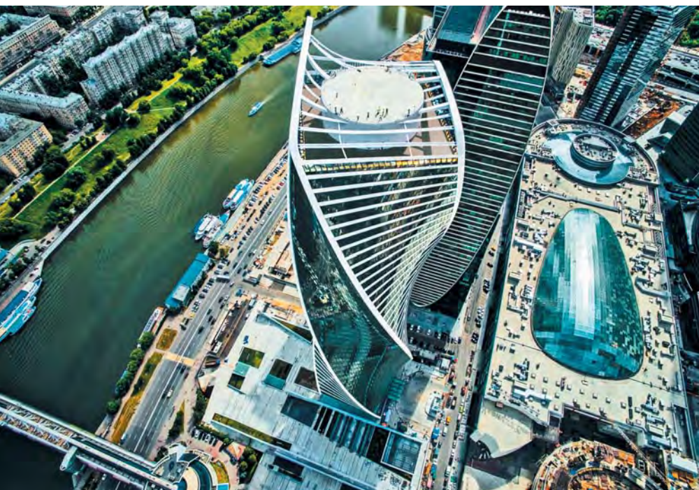
Figure 1. Evolution Tower, Moscow – aerial view

From the very beginning, the developer and architects set an ambitious goal: to create a recognizable and symbolic building that would be a new icon of contemporary