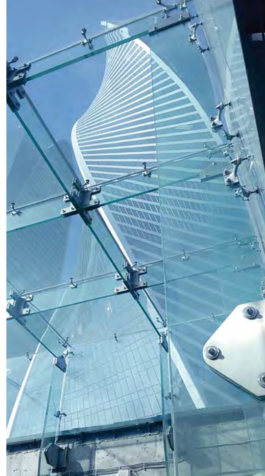
Figure 14. Podium retail mall skylights.

Completion Date: 2015 Height: 246 meters Stories: 55 Total Area: 82,000 square meters Use: office Owners: City-Palace LLC; ZAO Snegiri Development; Transneft Developer: ZAO Snegiri Development Architects: GORPROJECT (design); RMJM (design) Structural Engineers: GK-Techstroy (design); Gorproject (engineer of record) MEP Engineers: Renaissance Construction