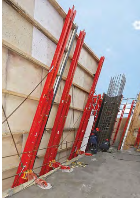
Figure 8. Inclined positioned RCS protection panel. © PERI GmbH