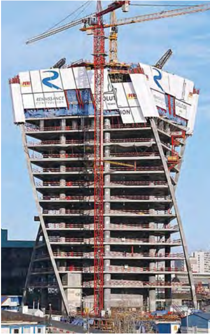
Figure 7. RCS protection panel unit enclosing the top three floors under construction. © PERI GmbH