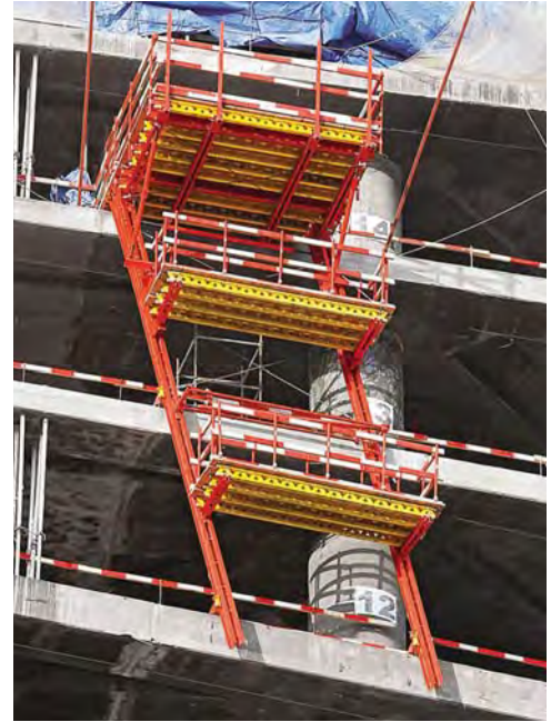
Figure 9. RCS landing platform.

columns (see Figure 7). The units, propelled by hydraulics, climbed the constant twist of the building where the installed rail-guided system (with inclined rails connected to the building frame by slab shoes) ensured a fast and safe ascent (see Figure 8). Landing platforms climb on rails hydraulically with the help of mobile climbing devices, and without a crane. On the sides of the building, rail-climbing system (RCS) platforms provide temporary storage areas and move loads (see Figure 9). This bespoke self-climbing formwork system achieved an impressive maximum framing speed of six days per floor, with an average speed of seven days per floor.