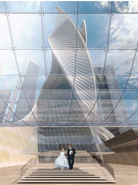
Figure 3. The City Palace Tower concept developed by RMJM showing the “bride’s skirt.”

“veil of the bride” above the sky bar. The Wedding Palace was a 2,000-square-meter “socially orientated” locomotive, hiding behind its atrium glazing the 80,000-square-meter office tower rising above it.