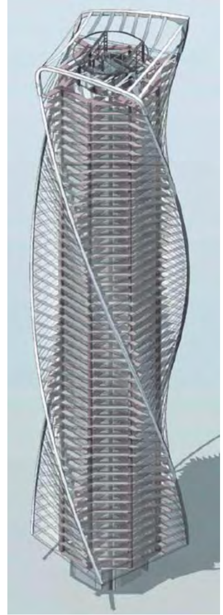
Figure 6 . Evolution Tower structural scheme.

This simple and innovative design was based on principles of twisting square-shaped floor plates with a vertical reinforced-concrete frame, supported by a central core and eight columns in an octagonal arrangement, with continuous beams and four spiraling columns at the corners (see Figure 5). The proposed structural scheme, with its cantilevered continuous concrete beams and cantilevered